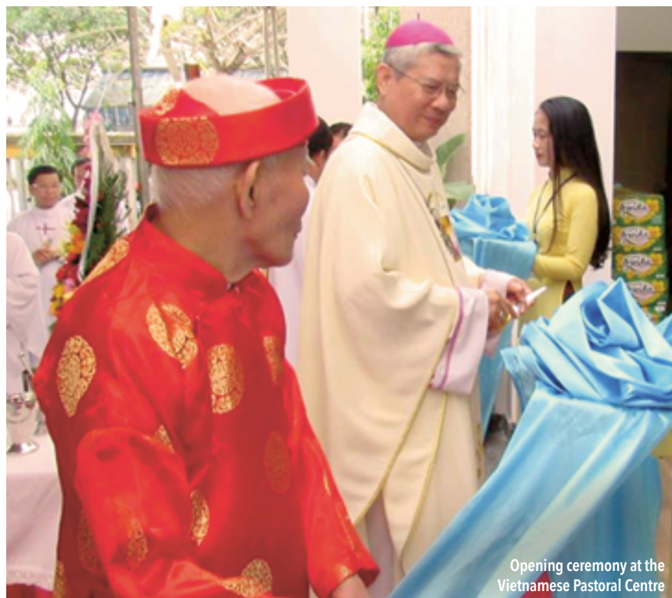
Opening ceremony at the Vietnamese Pastoral Centre