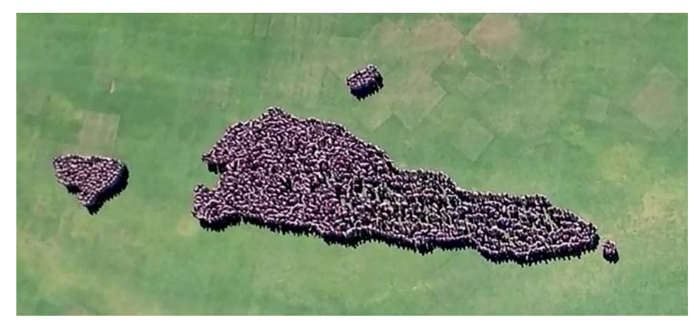
A Guinness World Record map of Timor-Leste by students and teachers at St Ignatius College Riverview.