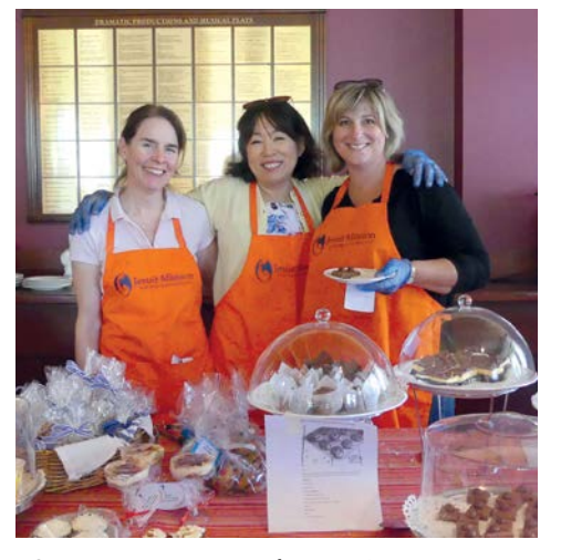
Volunteers running the View Café at the Indian Bazaai