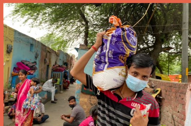
A man carries an emergency bag of rice.

However, thanks to your generosity, our partners can support distressed communities in a more coordinated and effective manner, slowing the spread of the virus through containment and transforming the lives of many vulnerable families in the long run.