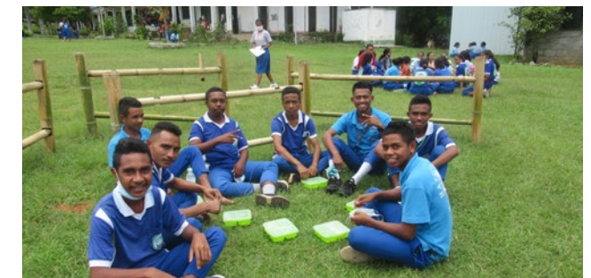
Lunch time at NOSSEF.