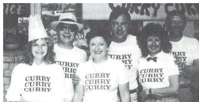
A curry stall at the Bazaar in 1985.

“We had drinks and ice creams and they had umbrellas around the quadrangle and Cardinal Gilroy came and opened the Bazaar with great fanfare.”