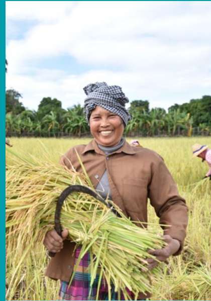
Emergency food packages, rapid crops and chickens, were given to farmers to stimulate income-generation and help them get back on their feet.

Self-Help Groups were also created to promote trust, team work and savings among vulnerable communities. Once the groups were functioning, each member received funds to be put in the group's bank account, to be used to support other members when needed.