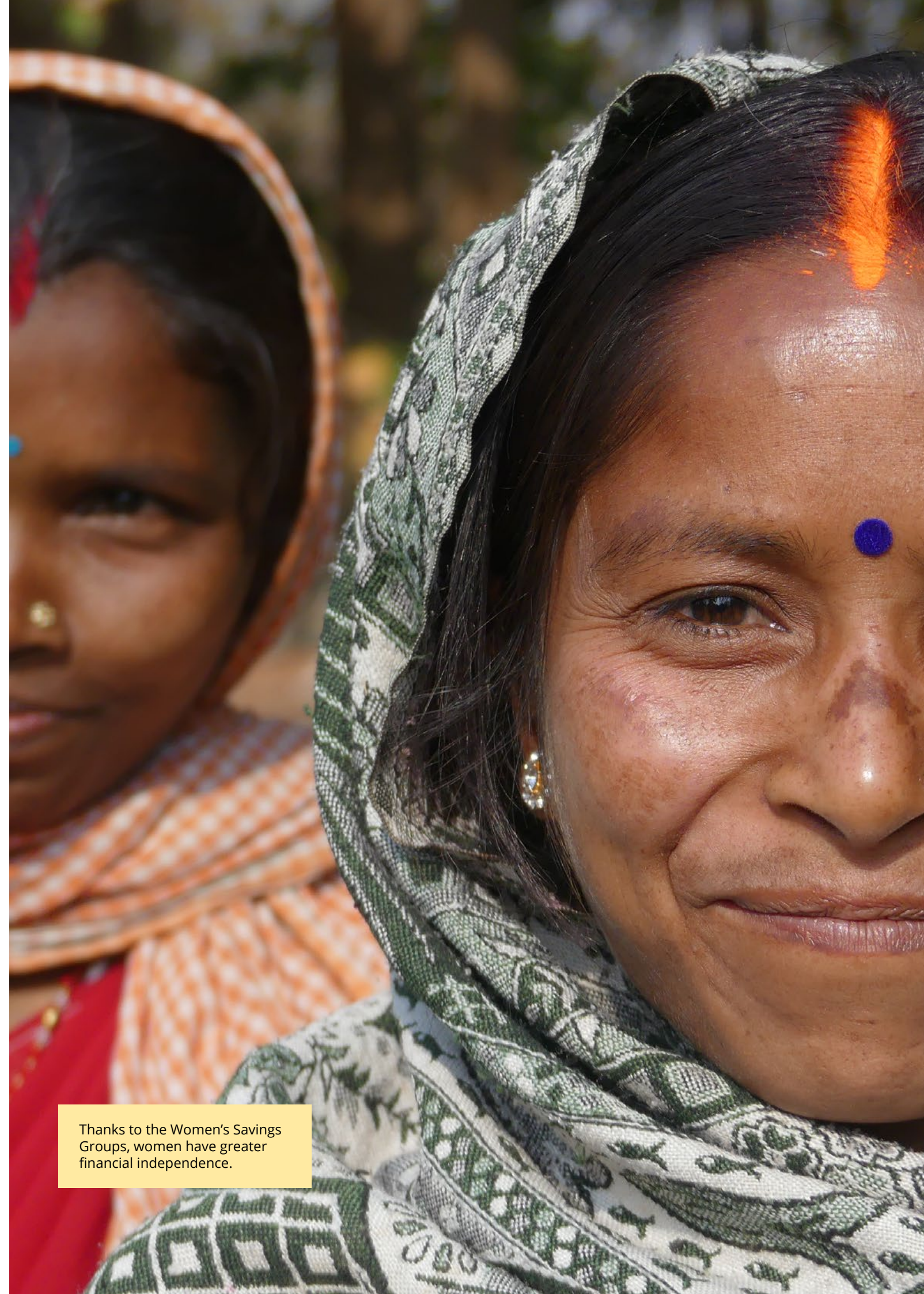
Thanks to the Women's Savings Groups, women have greater financial independence.