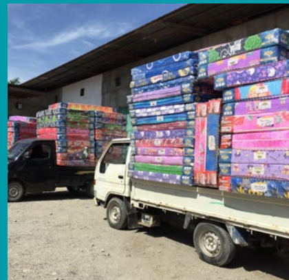
Mattresses were distributed to families who lost their livelihoods in the floods.

With your generous support, our partner Jesuit Social Service (JSS) responded to the flood crisis by providing emergency food supplies, mattresses and kitchen utensils for 330 families significantly affected by the floods.