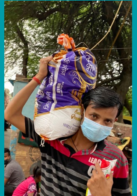
A man carries an emergency bag of rice.

Simultaneously, Lenity Australia generously funded the work of the Hazaribag Jesuits reaching out to struggling communities affected by COVID-19. Thousands of Indigenous Dalit women, men and children have benefitted from the Coronavirus Relief Project through income-generating activities and the provision of emergency food packages and masks.