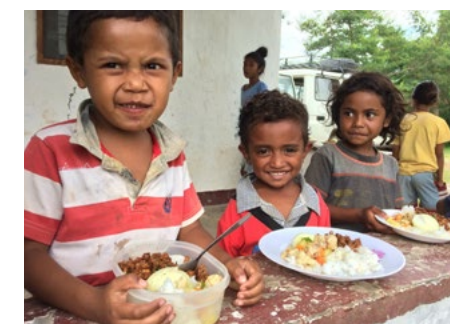
Above: NOSSEF students with new musical instruments. Below: Children sharing a nutritious meal.

communities rise from strength to strength, and supported over 11,500 people through these three programs last year.