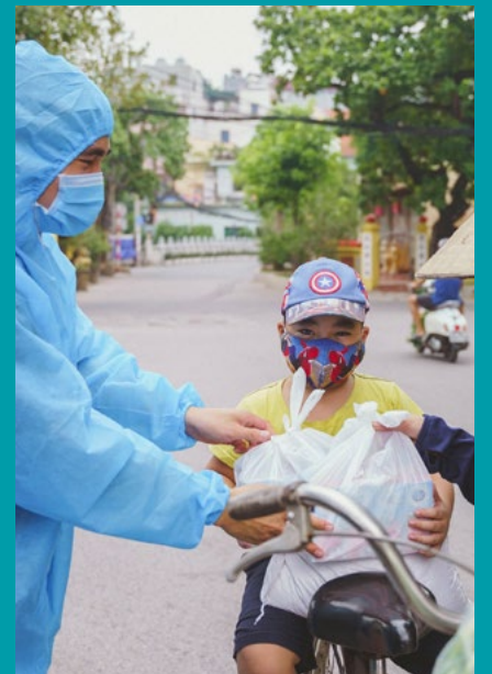
Delivering emergency food and milk to a family.

The Jesuits in Vietnam launched the Charity Rice and Food Supplies project to support families in crisis and provided milk to 8,000 children in the Southern Provinces of Vietnam.