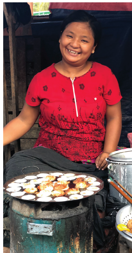
People in the slums of Myanmar are gifted with a micro loan to start their own businesses, such as a food stall.

This project provides teacher training and learning materials to improve the quality of education for children in IDP camps in Kachin State, to develop local teachers' capabilities to promote a safe learning environment.