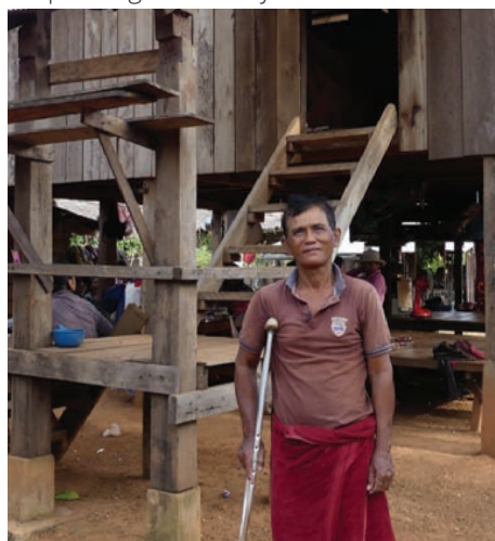
Everyone has the right to safety and shelter. Our partner KBO builds houses for those who need it.

The Ecology program focuses on supporting local communities in their forest conservation efforts. The four key themes include Ecological Restoration, Education and Advocacy, Research and Publications and Sustainability. Activities include management of a nursery and production of seedlings, with plans to provide 6,000 seedlings to local schools for planting of trees by students.