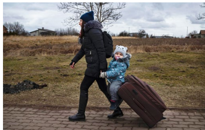
Above: A Ukrainian woman and her child. Top: A Ukrainian man and his son arrive in Poland.

At every opportunity people fleeing Ukraine have been warmly welcomed by Jesuits in neighbouring countries.