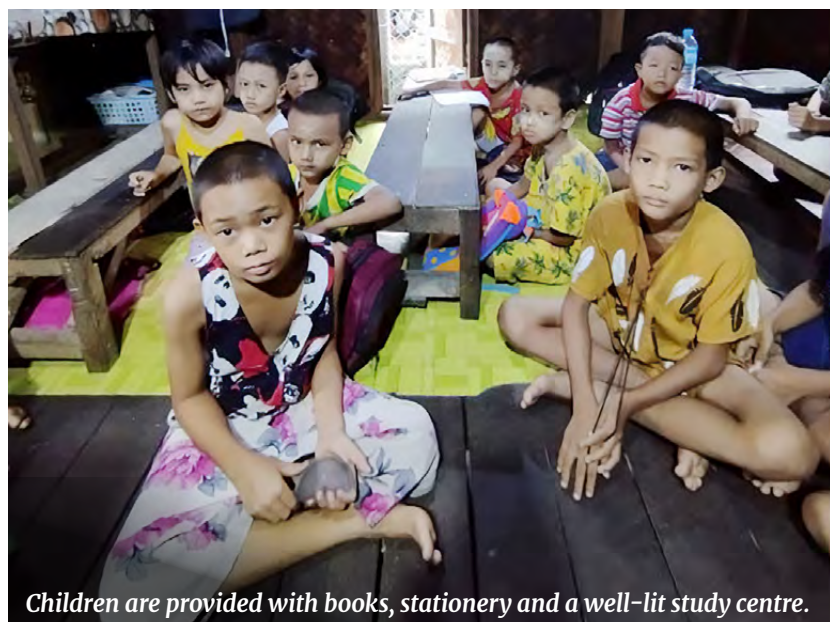
Children are provided with books, stationery and a well-lit study centre.