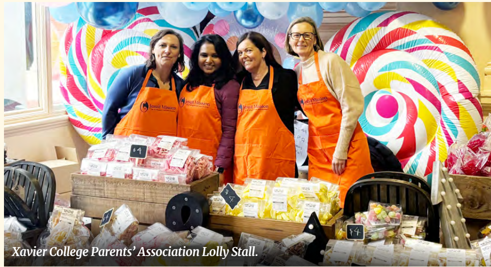
Xavier College Parents' Association Lolly Stall.