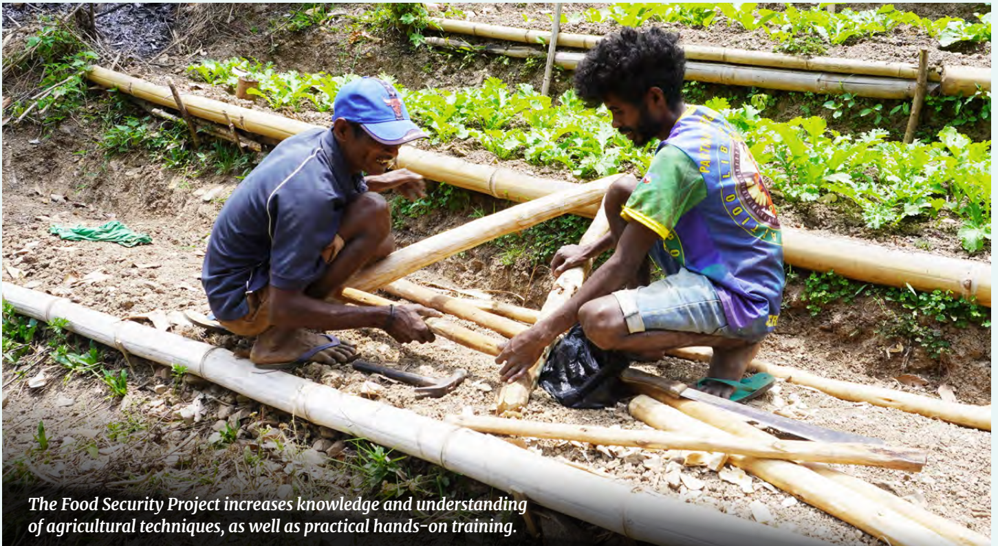
The Food Security Project increases knowledge and understanding of agricultural techniques, as well as practical hands-on training.