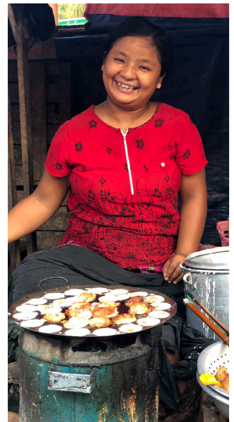
People in the slums of Myanmar are gifted with a micro loan to start their own businesses, such as a food stall.

For young people aged 16 and older from all over Myanmar Campion Institute maintains minimal fees to allow vulnerable students to access courses and a quality education.