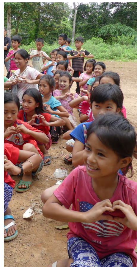
"Education with a heart" is taught at a refugee camp in Mae Hong Son.

With a fully operational farm on the campus, sustainability is key to the ethos of XLC.