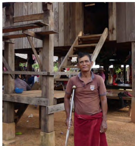
Everyone has the right to safety and shelter.

The Ecology program focuses on supporting local communities in their forest conservation efforts. The four key themes include Ecological Restoration, Education and Advocacy, Research and Publications and Sustainability. Activities include management of a nursery and production of seedlings, with plans to provide 6,000 seedlings to local schools for planting of trees by students.