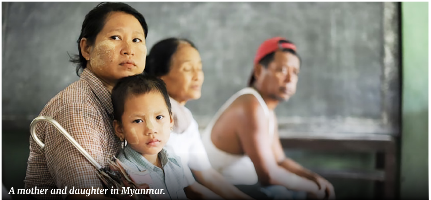
A mother and daughter in Myanmar.

Days before Christmas 2024, a Jesuit parish was shattered by two 500-pound bombs. One exploded, destroying two-thirds of the church hall. The other, live but unexploded, embedded itself in front of the church at the feet of a St Michael statue.