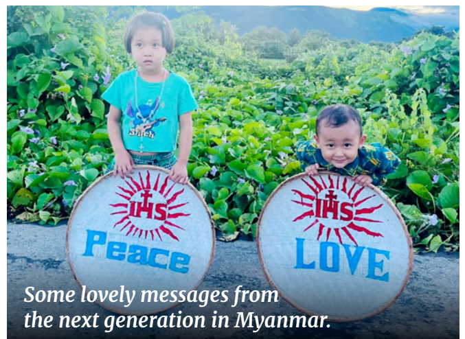
Some lovely messages from the next generation in Myanmar.