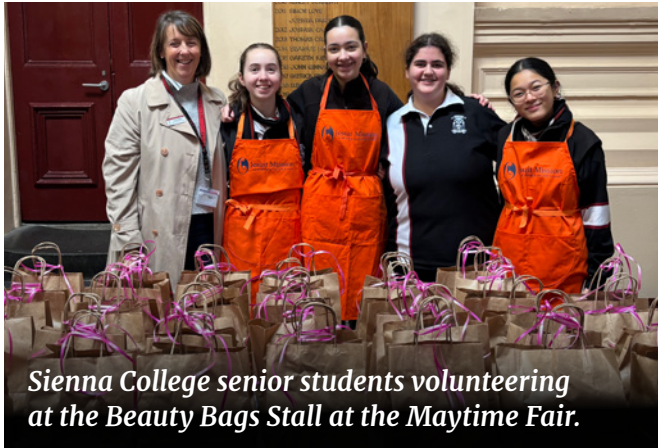
Sienna College senior students volunteering at the Beauty Bags Stall at the Maytime Fair.

Your efforts embody the values of justice, equality and solidarity, and every dollar you've raised will help empower marginalised members of our global family in more than 10 countries.