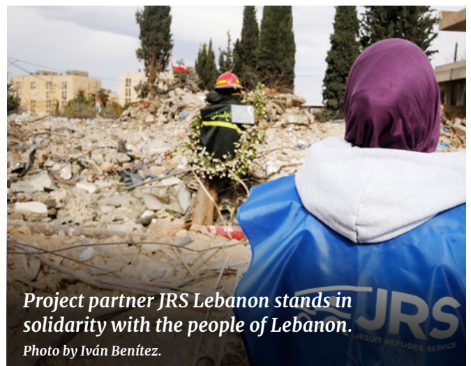
Project partner JRS Lebanon stands in solidarity with the people of Lebanon.