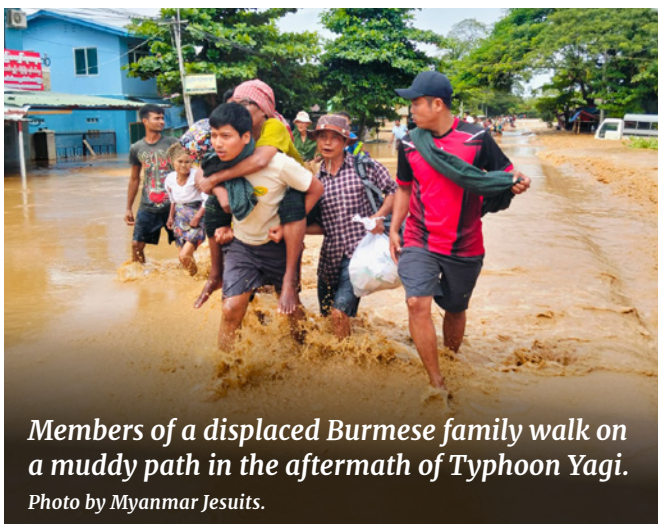
Members of a displaced Burmese family walk on a muddy path in the aftermath of Typhoon Yagi.