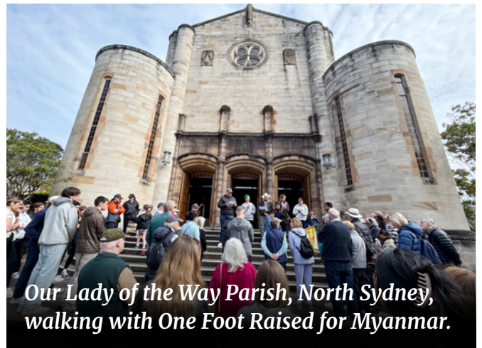
Our Lady of the Way Parish, North Sydney, walking with One Foot Raised for Myanmar.

Thank you for all your support in many ways to the people of Myanmar!"